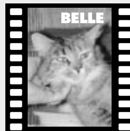
Belle was trapped in the ceiling of a house for days until rescued.