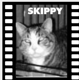
Skippy, a large sweet male was surrendered by a couple. Once they left we noticed he had a kitten collar totally embedded in his skin, we removed it immediately and cared for him.