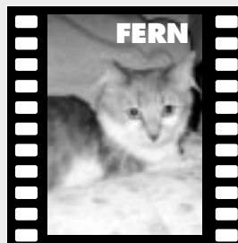
Fern and her kittens were living in a dreadful junkyard.