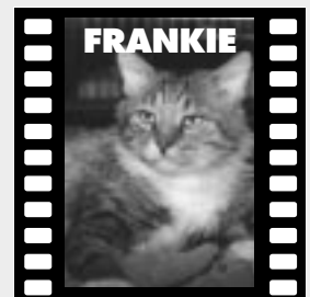
Frankie was run over by a car in Lynn and recovered after long care.